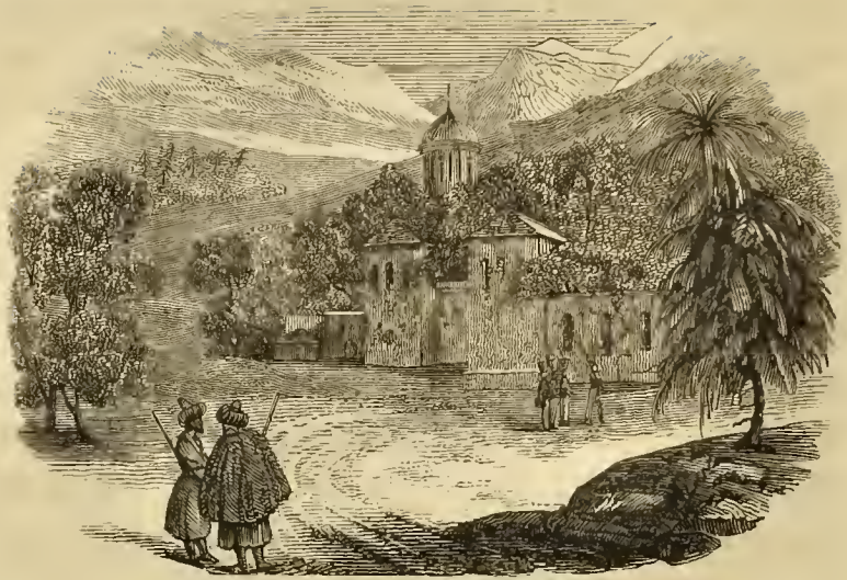
GREEK CHURCH BUILT BY JUSTINIAN AT PITZOUNDA.